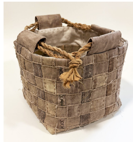
by E Segal